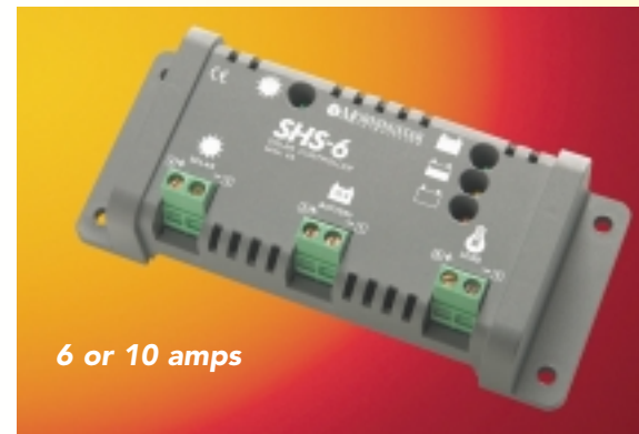
6 or 10 amps